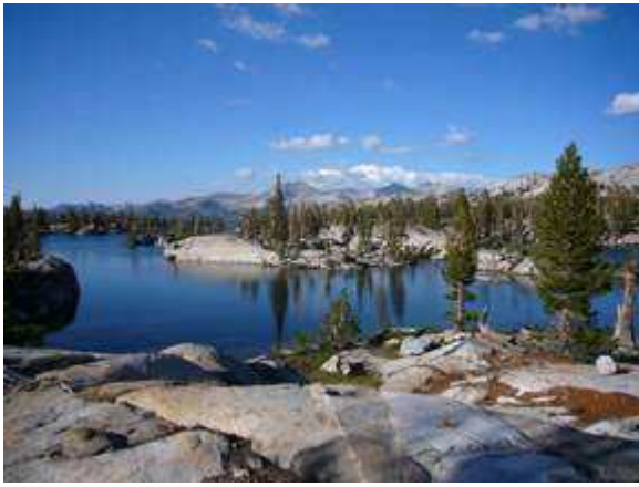
Early evening at Red Devil Lake with Mounts Florence, Maclure, and Lyell in the background.